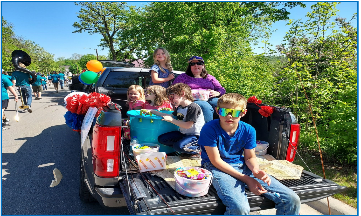
Fun was had by all at Preston Trout Days parade