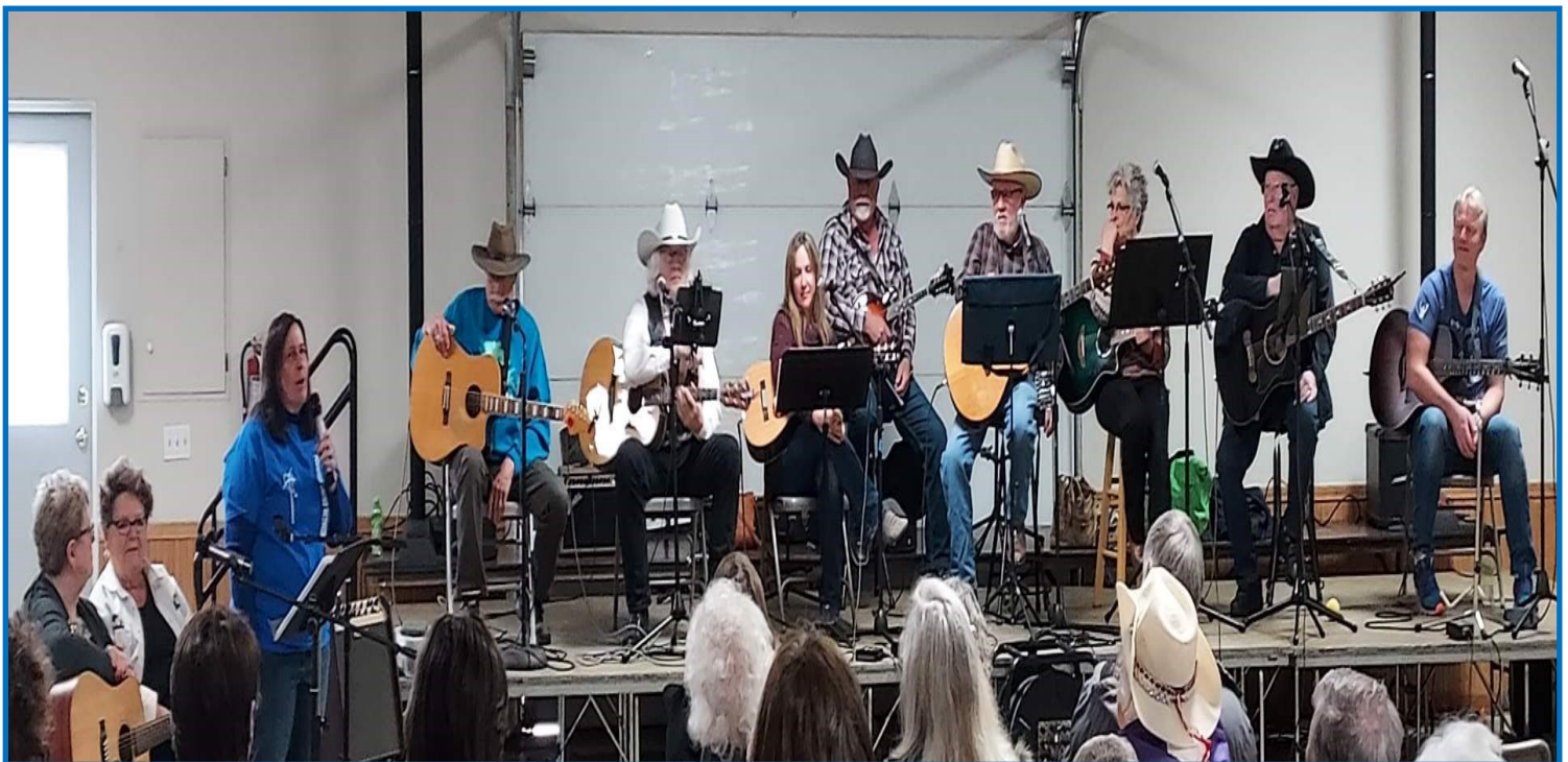
Fountain Cowboy Concert and Jam on April 30th at the Fountain Community Center was a great success! Thank you